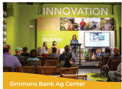
Simmons Bank Ag Center